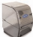
ComfortPro ™ Chrome Kits